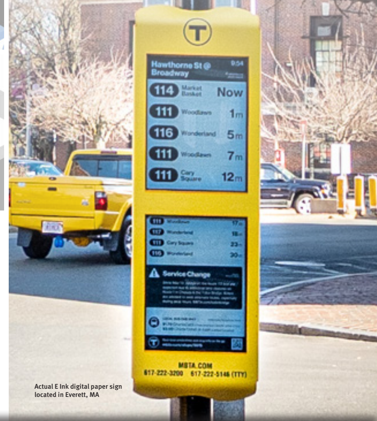
Actual E Ink digital paper sign located in Everett, MA

Contact E Ink to Learn More | eink.com/transportation